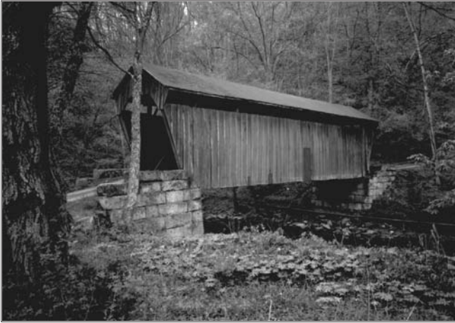
Fletcher Covered Bridge, Harrison County, W.Va.