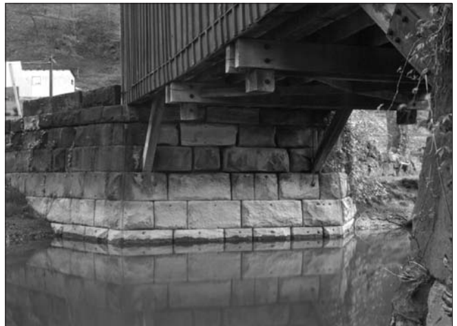
Clockwise from top: Carrollton Covered Bridge, Barbour County, interior west wall showing multiple king post and Burr arch truss. (IHTIA); Walkersville Covered Bridge, Lewis County, west abutment. (IHTIA); Typical vertical post assemblage, Barrickville Covered Bridge. (Paul Boxley)