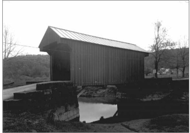
Walkersville Covered Bridge, Lewis County, W.Va.