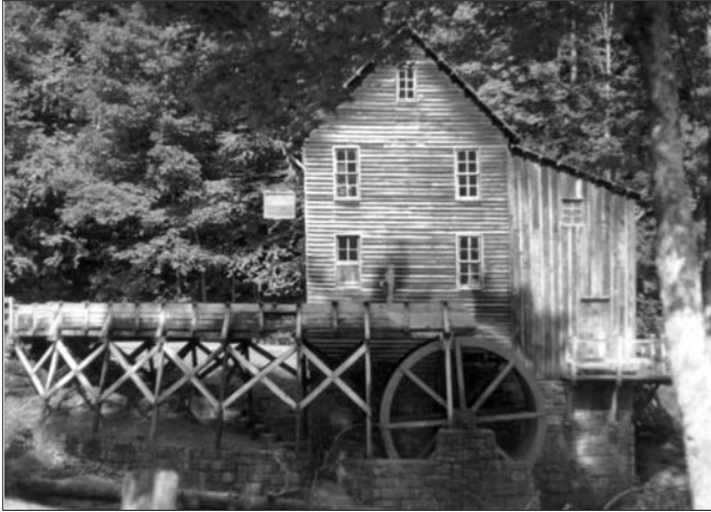
One of the Midland Trail's cultural resources, Glade Creek Grist Mill in Babcock State Park, W.Va.