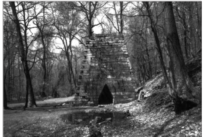
The 1836 Henry Clay Furnace, located at Coopers Rock State Forest, was a Sunday tour stop.