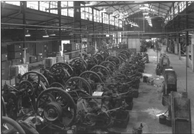
The Wheeling-La Belle Nail Company cut-nail plant was a stop on the Friday early bird tour.