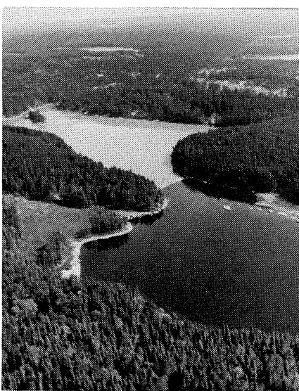
Fig. 1. Lake 226, demonstrating the vital role of phosphorus in eutrophication. The far basin, fertilized with phosphorus, nitrogen, and carbon, was covered by an algal bloom within 2 months. No increases in algae or species changes were observed in the near basin, which received similar quantities of nitrogen and carbon but no phosphorus.

In an early experiment, phosphate and nitrate were added to lake 227,